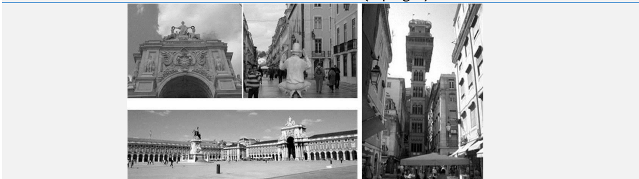
Fig. 01: (top left) Arco da Rua Augusta, Rua Augusta (top center), Praça do Comércio (down left), Elevador de Santa Justa (top right).

Lisbon Downtown has presently three main borders – Tejo River, Rua do Carmo (Carmo Street) and Rua da Madalena (Madalena Street). Whereas all the most recognizable global brands stores are spread across the whole district, Madalena Street has lost its social features and is inhabited mainly by people from various ethnic groups, serving only as a hinge between the downtown and the castle area. Accordingly, the residents of Lisbon and tourists have been rarely visited the street in recent years. The majority of main tourist attractions such as the Design Museum, the Augusta Street, the Praça do Comércio (Commerce Square), Rio Tejo (Tagus River), the Santa Justa Lift (Fig.1), and Rua do Carmo (which connects downtown and the Bairro Alto district, a very popular restaurants and bars area of the city) are located in the central downtown area.