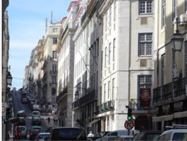
Fig. 04: Lisbon downtown, Rua da Madalena (Madalena Street) today.

As was already established in the initial phase of the study, in order to find the most suitable specialization for the street, it was necessary to carry out a detailed analysis of the current urban form and architecture. The field work provided the complex characteristic in this area. The most typical elements for Rua da Madalena are the multi-family residential and commercial building (Fig 4) integrated in the Pombaline reconstruction plans, cage structure, with shops on the ground floor and three floors of housing and lofts, the stair case. The Main façade follows the architectural uniformity typical from the Pombaline layout.