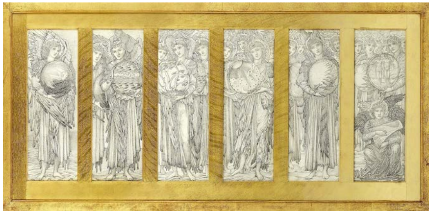
Fig. 1. Edward Burne-Jones, The Days of Creation , 1870-76, pencil drawing Private Collection