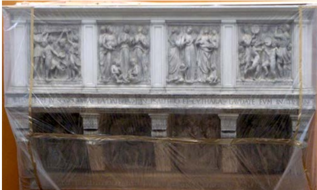
Fig. 6. Luca della Robbia, Cantoria , 1438, 19 th century replica Victoria and Albert Museum, London