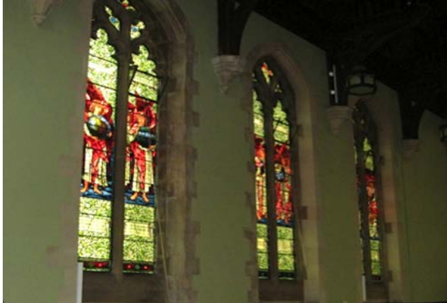
Fig. 5. Edward Burne-Jones, The Days of Creation , 1894, porcelain Saint Dyfrig Chapel, Saint David Llandiff Cathedral, Cardiff, Wales