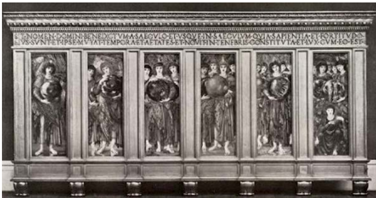
Fig. 3. Edward Burne-Jones, The Days of Creation , 1876, originally framed Fogg Art Museum, Harvard University, Cambridge, MA See also http://www.williammorristile.com/burne_jones_days_of_creation_angels.html