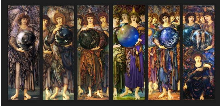
Fig. 2. Edward Burne-Jones, The Days of Creation , 1876, watercolor Fogg Art Museum, Harvard University, Cambridge, MA See also http://www.williammorristile.com/burne_jones_days_of_creation_angels.html