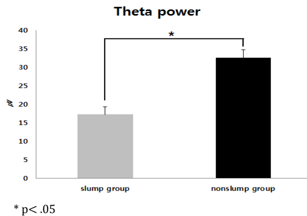
Figure2. Frontal theta power differences among Fp1, Fp2, F3 and F4