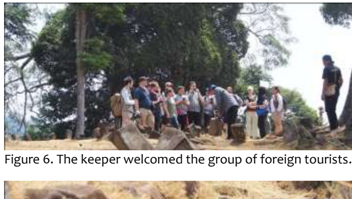
Figure 6. The keeper welcomed the group of foreign tourists.