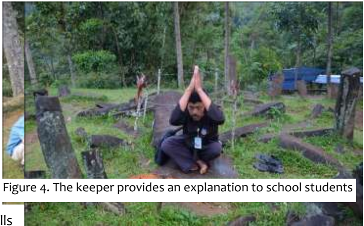
Figure 4. The keeper provides an explanation to school students

b. The keeper cleans the site area from trash