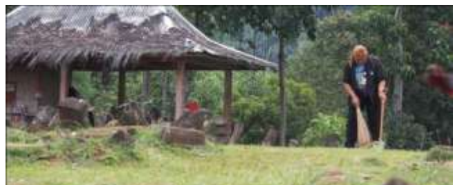
Figure 9. The keeper raised the flag as a symbol of the country.

Based on the plot elements, the photo visualizes the keeper raising the red and white flag. From the viewpoint element, this photo uses left framing, with a medium size shot, so that the keeper's body parts are not displayed intact. From the elements of character, this photo builds character as an Indonesian citizen. From the event element, this photo tells the task and responsibility of the keeper to always mark the prehistoric site as an asset of the nation. From the elements of time and place, this photo visualizes the atmosphere of the morning on the fifth terrace which can be seen from the background of the upper trees. From the element of causal relations, this photo builds a perception of love for the motherland.