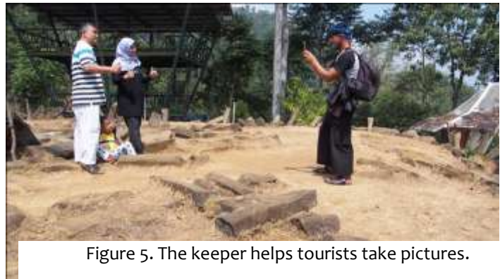
Figure 5. The keeper helps tourists take pictures.