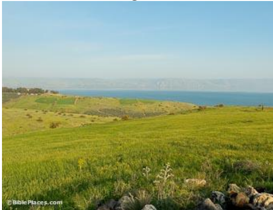
Figure 1. The Galilean level and hillside 26

In terms of educational policy, this study gives a good insight to the Ministry of Education in Korea. This research strongly suggests that the policy of the more generalized religious education should be adopted. Practicing that education is quite close to a well-developed global standard. Intrinsically, it also goes well with the human rights, more specifically the right to learning of the learners as well as to teaching of the teachers concerned.