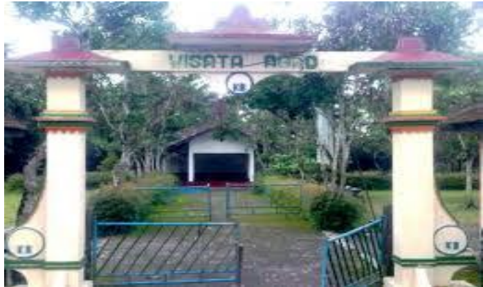
Figure 2: Agrowisata Kabupaten Sleman

At first the facilities available were not as complete as the ones available at present. When it was first announced as tourism site, it was still filled with growing Javanese salak trees. In 1987, a change of plants was made there; all Javanese salak plants were replaced with salak pondoh plants. The difference between these two salak types is that Javanese salak often tastes sepet ('rather bitter') while salak pondoh tastes sweet. Certainly at that time the salak pondoh plants were still small because they were still new plants in the form of plant seedlings. The process of growth of salak pondoh plants took time so that only by 1989 the salak pondoh seedlings had grown large. Then it was seen that salak pondoh plants sufficiently made a beautiful sight and promised a good future.