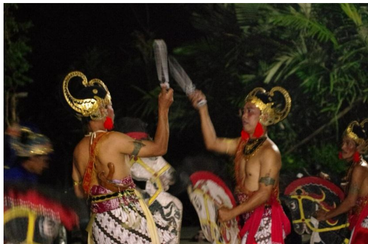
Figure 3: The dancers started the first episode of the show jathilan

The background of why the jathilan art form is the one adopted to be put under management and turned into an art form for tourism by the people managing Agrowisata is that it is easily found around the Agrowisata site, originating in the villages of, among others, Gadung, Gesikan, Selor, Ngangkrik Tejosari, Sucen, and Kromodangsan. In addition, the jathilan art form is a traditional performing folk art form that has been the most liked among the people up to now. Esthetically,